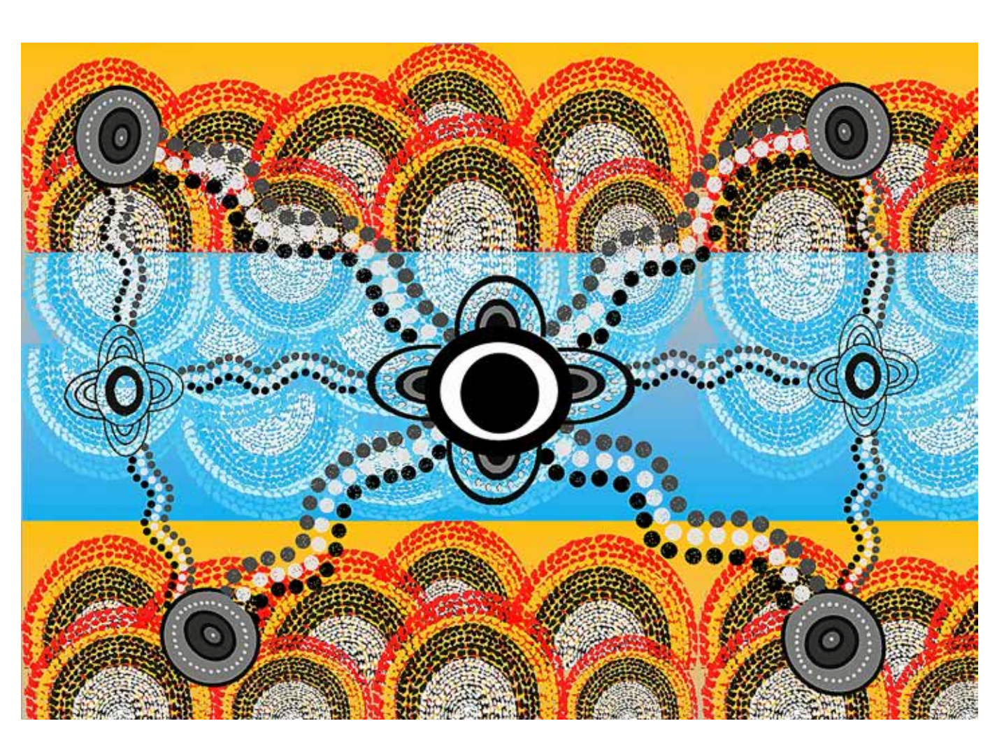
'Fire & Water' by Daniel Roberts, a proud Bundjalung man from Cabbage Tree Island.