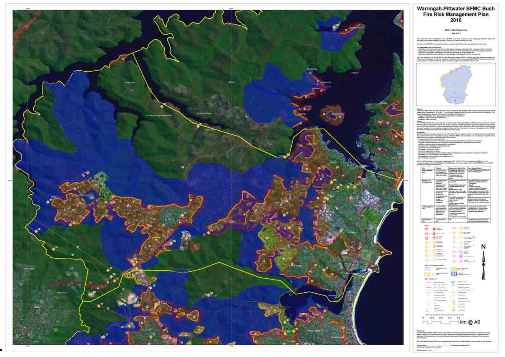
Bush Fire Coordinating Committee – Policy No 1/2008 Adopted by the Bush Fire Coordinating Committee - Minute No. 24/2008 Page 187 of 189