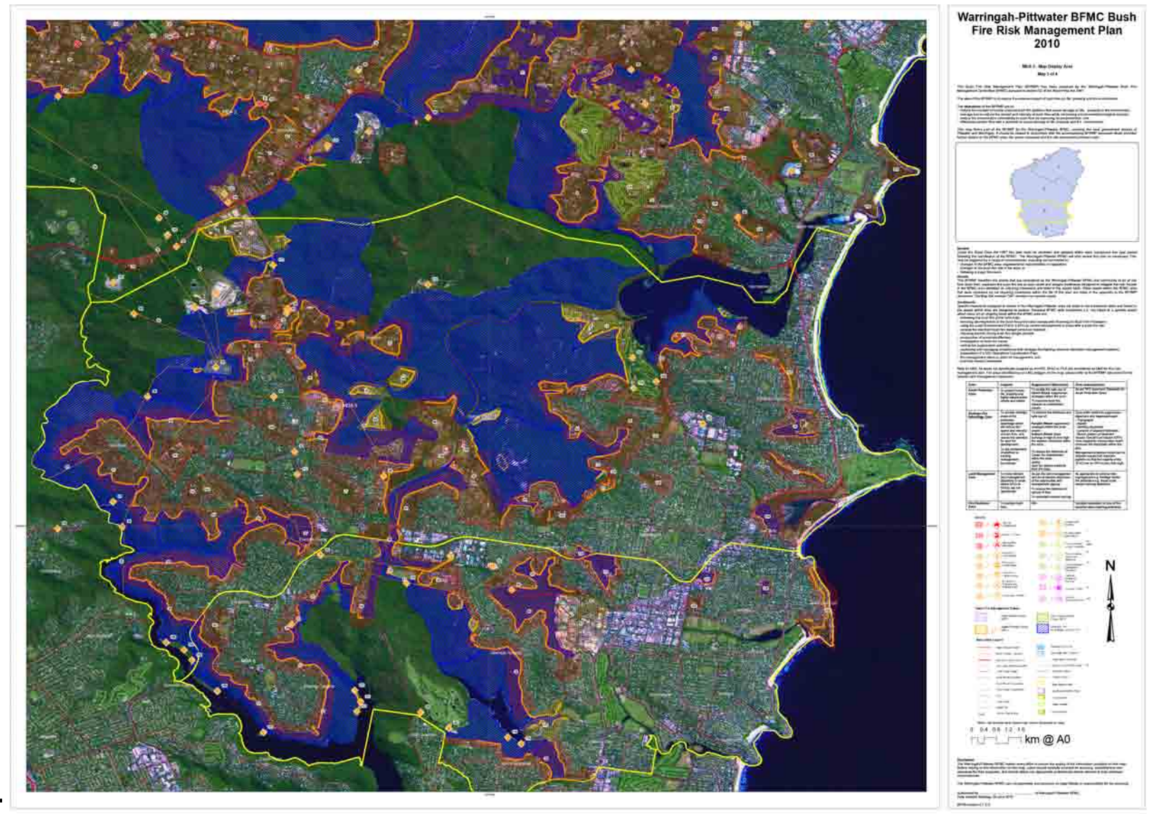
Bush Fire Coordinating Committee – Policy No 1/2008 Adopted by the Bush Fire Coordinating Committee - Minute No. 24/2008 Page 188 of 189