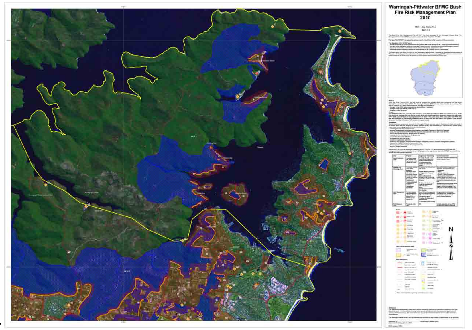
Bush Fire Coordinating Committee – Policy No 1/2008 Adopted by the Bush Fire Coordinating Committee - Minute No. 24/2008 Page 186 of 189