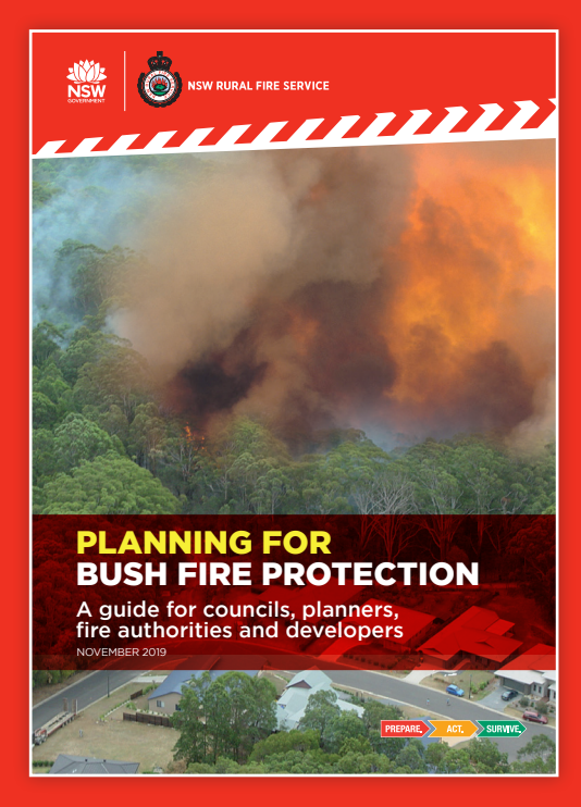
Fig 1. RFS publication Planning for Bush Fire Protection 2019.

This kit takes you through each step in the bush fire assessment process and explains how to complete the Bush Fire Assessment Report (BFAR) which will need to accompany your Development Application (DA). This document is intended for use only where the proposed development are on existing land having a dwelling entitlement and where no new infrastructure for example roads and hydrant systems are required. Where the intention is to increase the residential density of a site like dual occupancies, multiple dwellings, boarding homes, workers cottages and any other similar proposals, a bush fire assessment report may be required for existing development. Furthermore, it is intended for use only where the bush fire assessment is straightforward from a vegetation classification and slope calculations being considered. For other situations, the services of a suitably qualified bush fire consultant should be obtained.