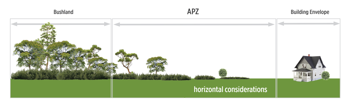
Figure 7 Asset Protection Zone (APZ)

Although it is possible to build using BAL-Flame Zone construction levels, providing a minimum defendable space and APZs wherever possible will increase the resilience of your home in bush fire situations.