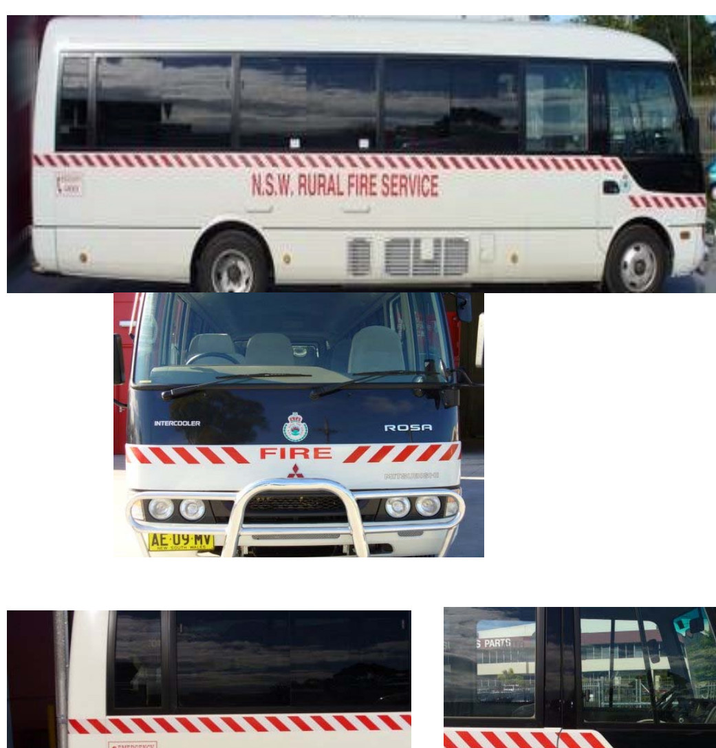
Category 20 - Other Appliances/Vehicles (indicative)