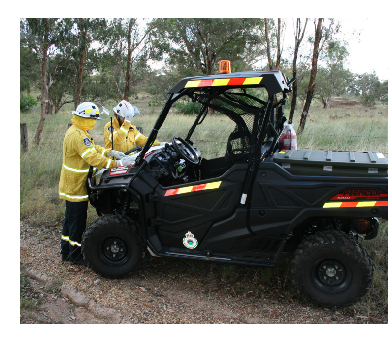
A new all-terrain vehicle (ATV) purchased by the Liverpool Range District as part of the Trust's district funding program.

In late 2021, the Trustees approved and paid $18 million to the NSW RFS to cover the cost of these district projects. The Trustees have set an expectation with the NSW RFS executive that these funds will be spent by the end of 2022.