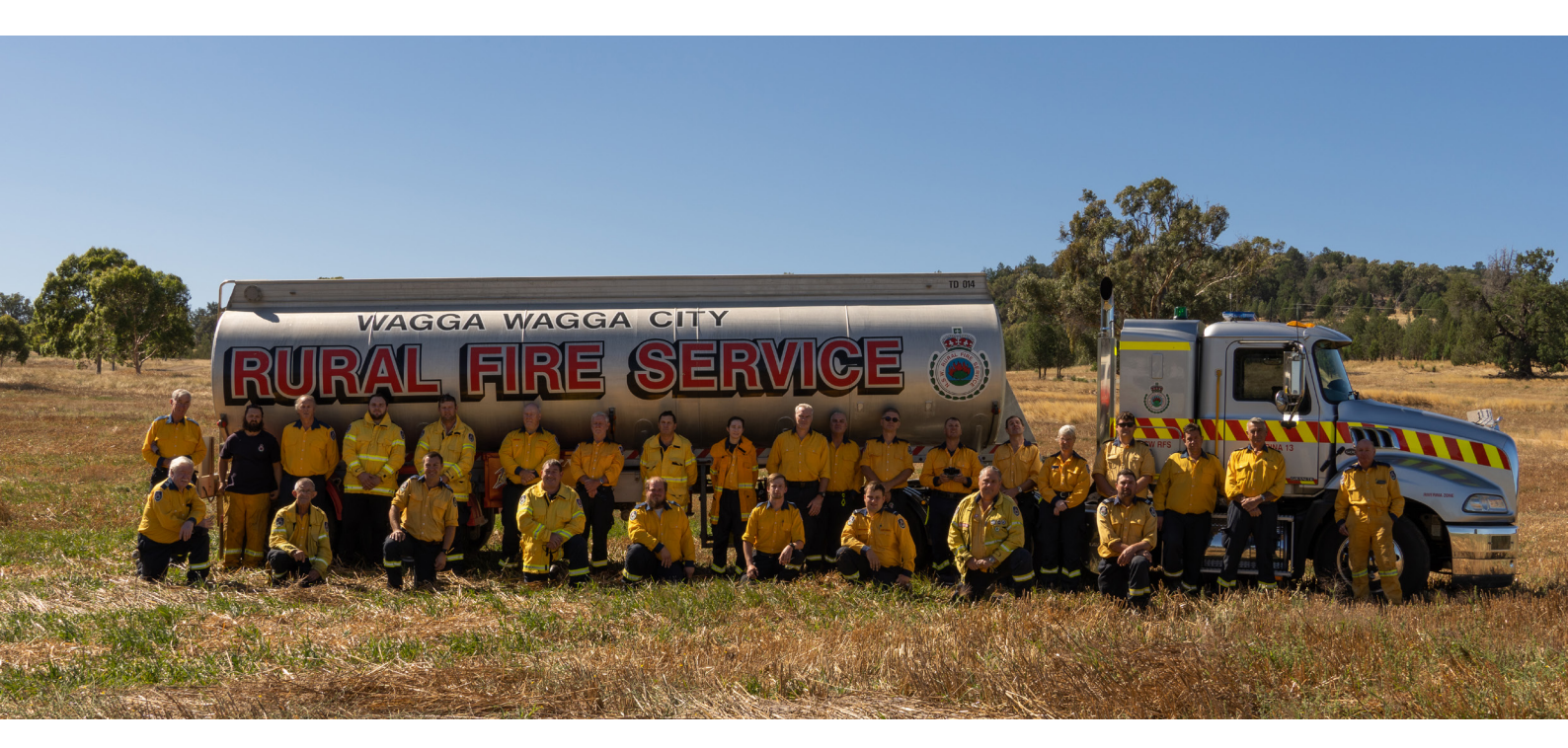
Members of the Riverina District with their new prime mover, funded by the Trust through the Brigade Grant Scheme.