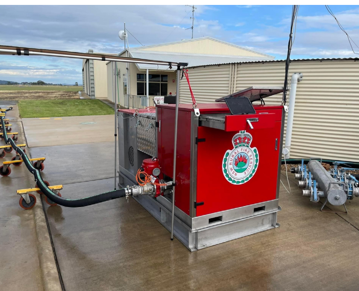
A Retardant and Suppressant Computerised Automated Loading (RASCAL) system at Wagga Wagga Airport for automated pumping of NSW RFS aircraft. One of only two such systems in operation in NSW, purchased as part of the Trust's district funding program.