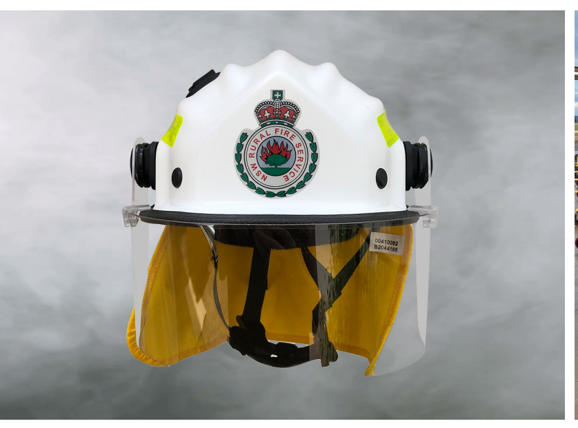
New BR9 helmet

The Trustees have agreed to provide funding of at least $36 million to this project.