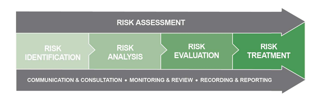
Figure 1: Overview of the risk assessment process

The Australia/New Zealand Standard AS/NZS 31000: 2018 Risk Management was used to guide the bush fire risk assessment process. This is outlined in Figure 1 below.