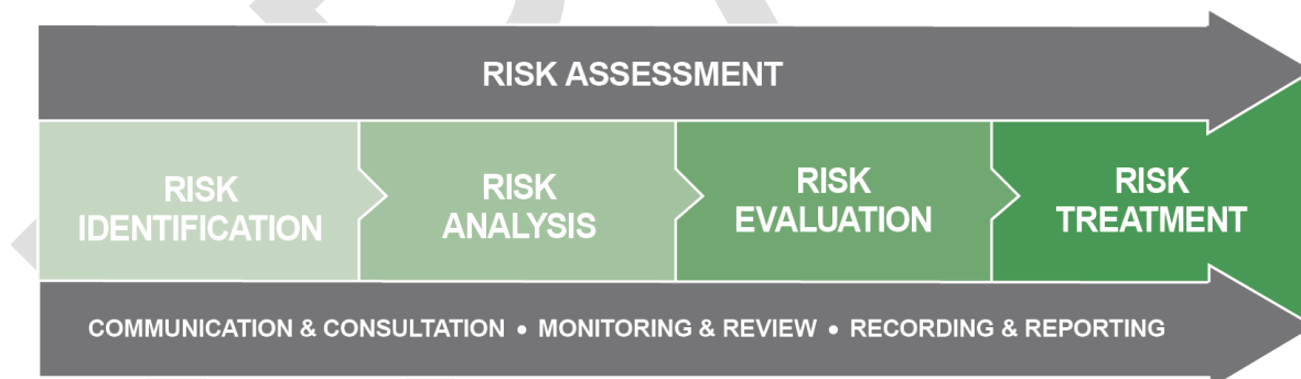
Figure 1: Overview of the risk assessment process

The Australia/New Zealand Standard AS/NZS 31000: 2018 Risk Management was used to guide the bush fire risk assessment process. This is outlined in Figure 1 below.