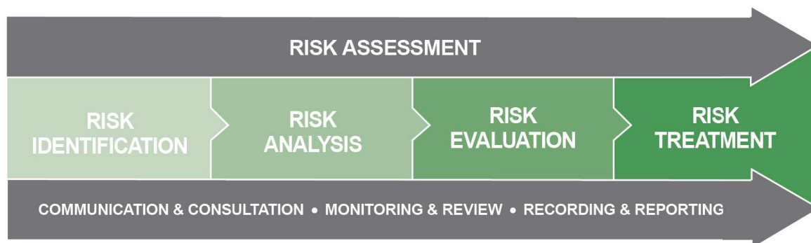
Figure 1: Overview of the risk assessment process

The Australia/New Zealand Standard AS/NZS 31000: 2018 Risk Management was used to guide the bush fire risk assessment process. This is outlined in Figure 1 below.