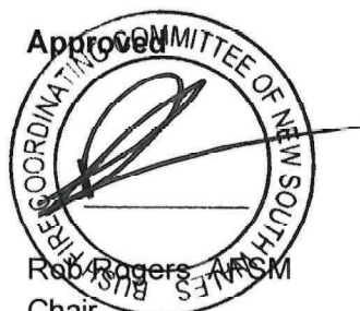
Rob Rogers AMCM