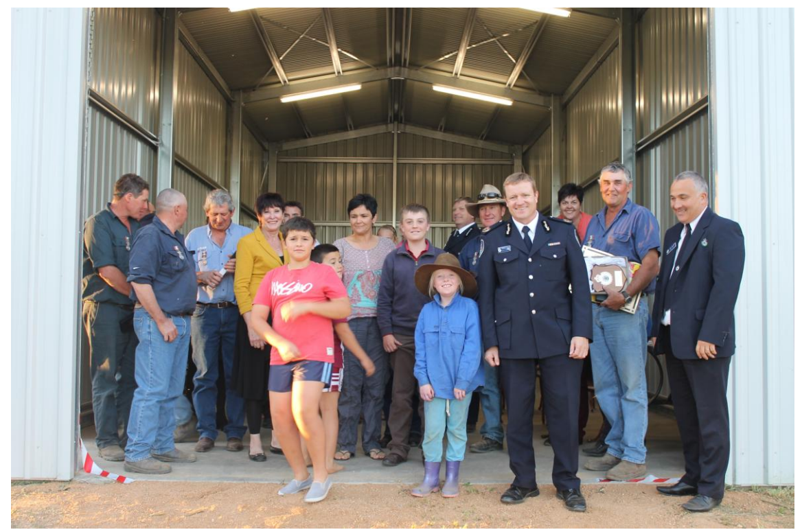
Long serving members of Monwonga RFB received awards and opened their new Station