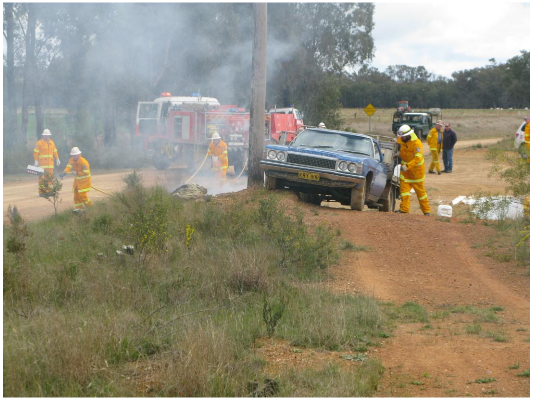
Crews Respond to a "Motor Vehicle Accident" at the Greenethorpe Exercise