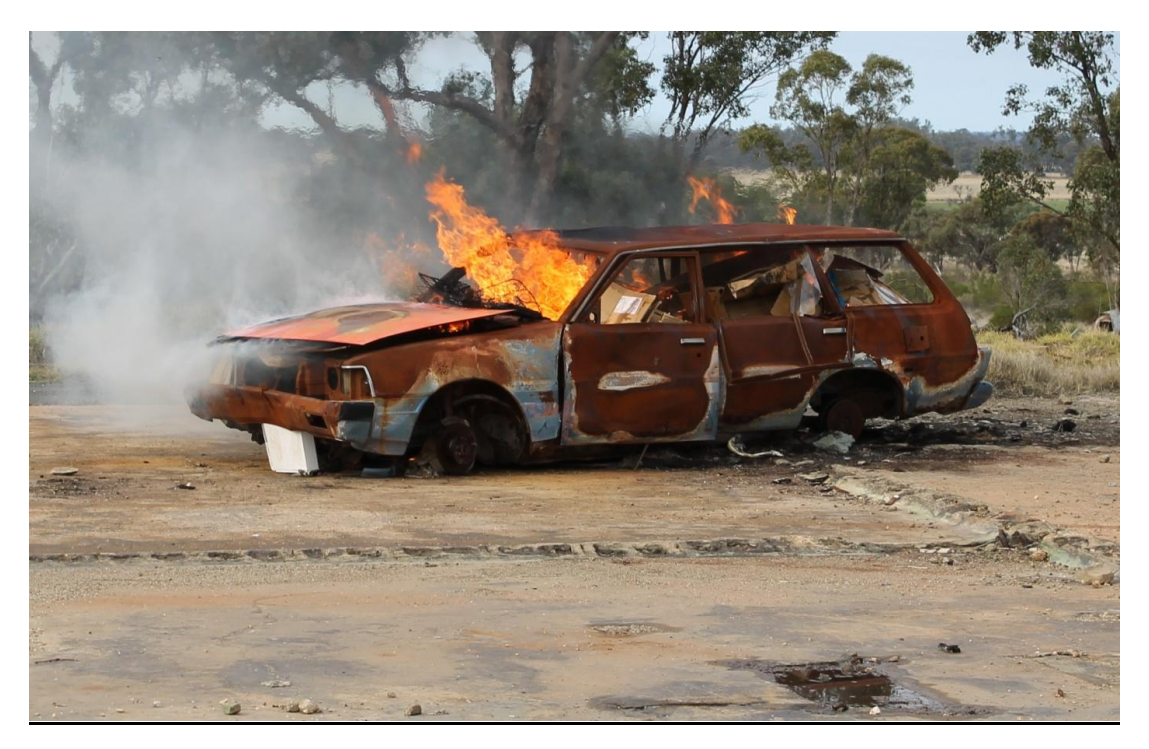
Village Fire Fighter Training Ground Condobolin