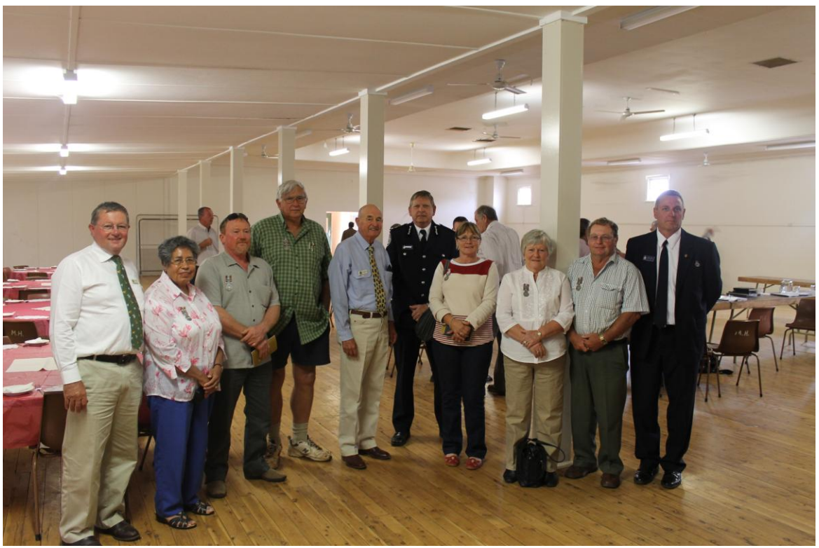
Members of Brewer/Bootawa RFB receive Long Service Medals