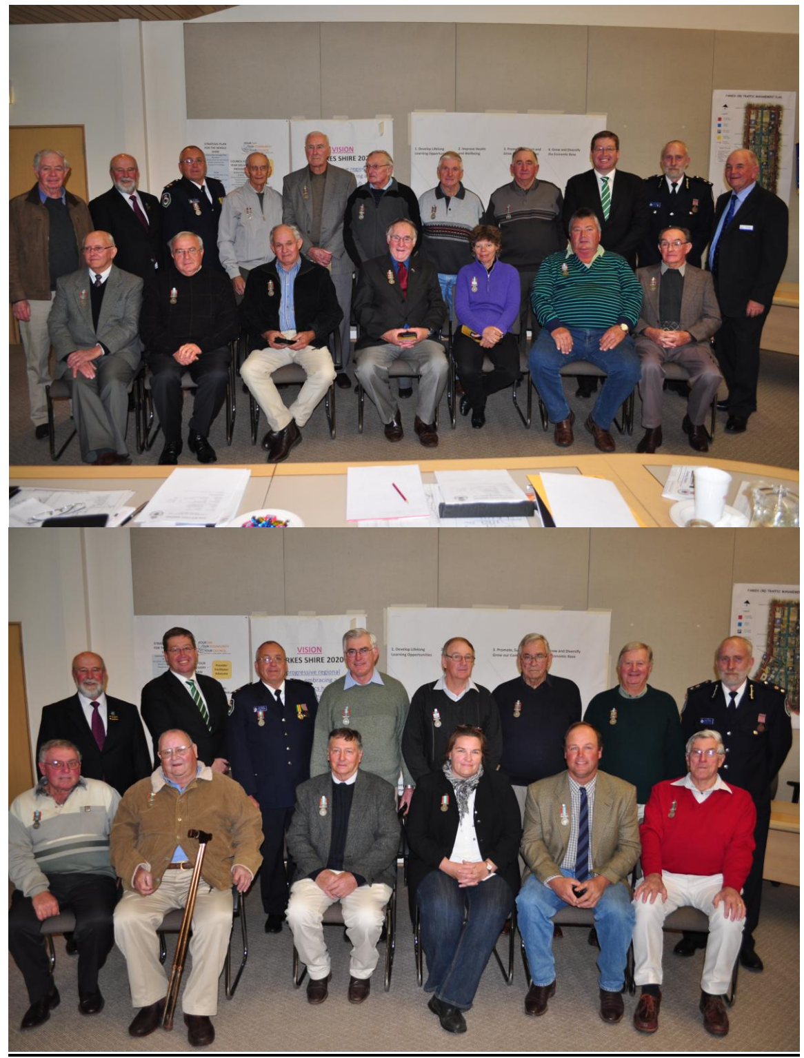
The Troffs and Tichbourne members received Long Service Medals at PSC