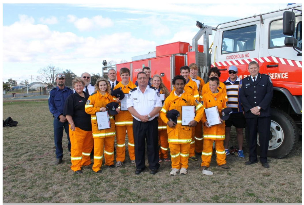
Condobolin Cadets with their Certificates after completing the Program