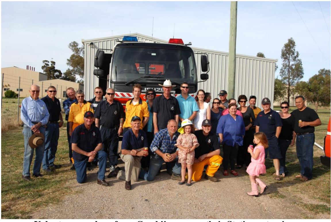
Volunteer members from Cumbijowa open their Station extensions