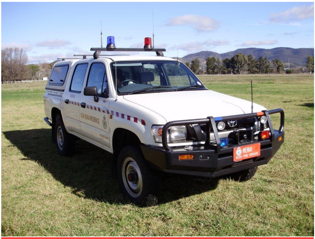
Lachlan 16 E acquired from Sutherland District