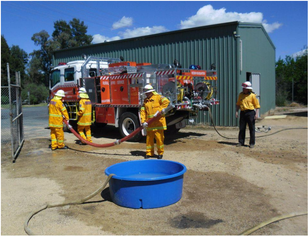
Members Practice their New Skills at Weddin Basic Fire Fighter Training