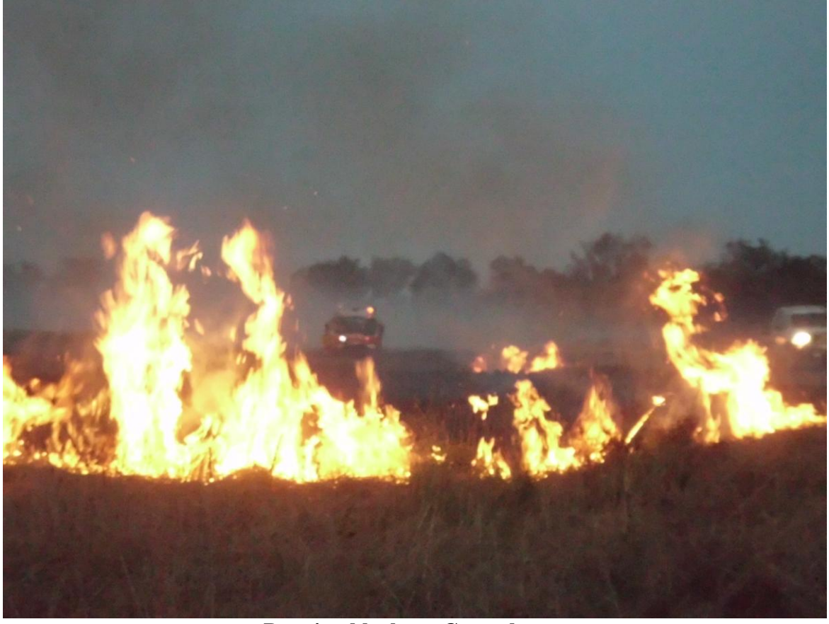
Burning blocks at Greenthorpe