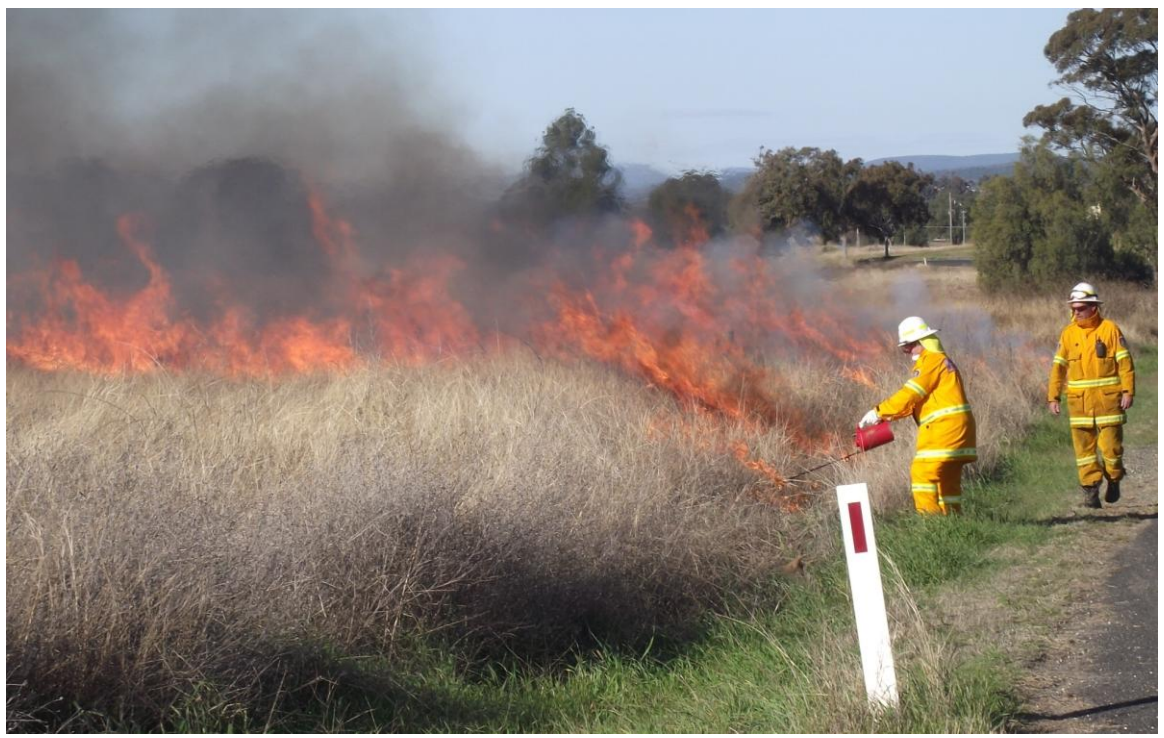
Getting rid of a heap of fuel at London Road