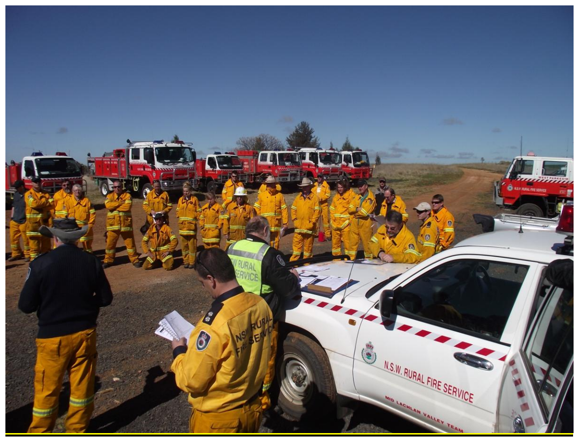
Getting a briefing before burning at Parkes