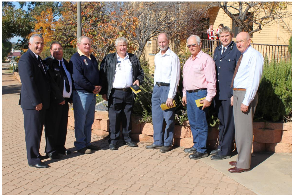
Baratta Brigade Members receive Long Service Medals for their efforts over many years