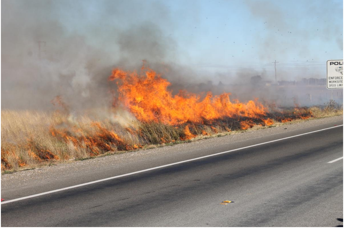
Roadside burning being undertaken along the Newell Highway in Back Yamma area