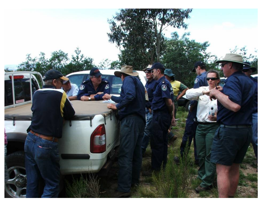
"Where Risk Management is our Passion and Hazard Reduction is our Priority"

During 2008/2009 these meetings identified many opportunities for hazard reduction on private land as well as on Forest NSW and NPWS tenure.