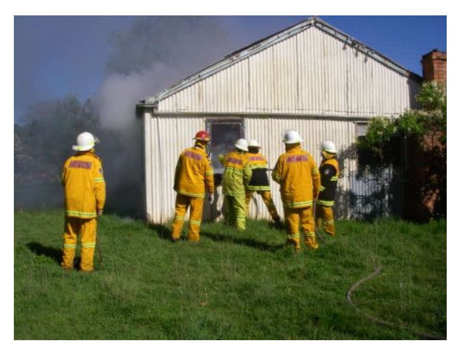
Training exercise house burn Springside 2009.

The Zone is working towards meeting Service Standard 6.1.2 which provides details on the required qualifications for all levels of the organisation, volunteer or staff. Over the next two years the focus will be on the Bush Firefighter (BF) qualification.