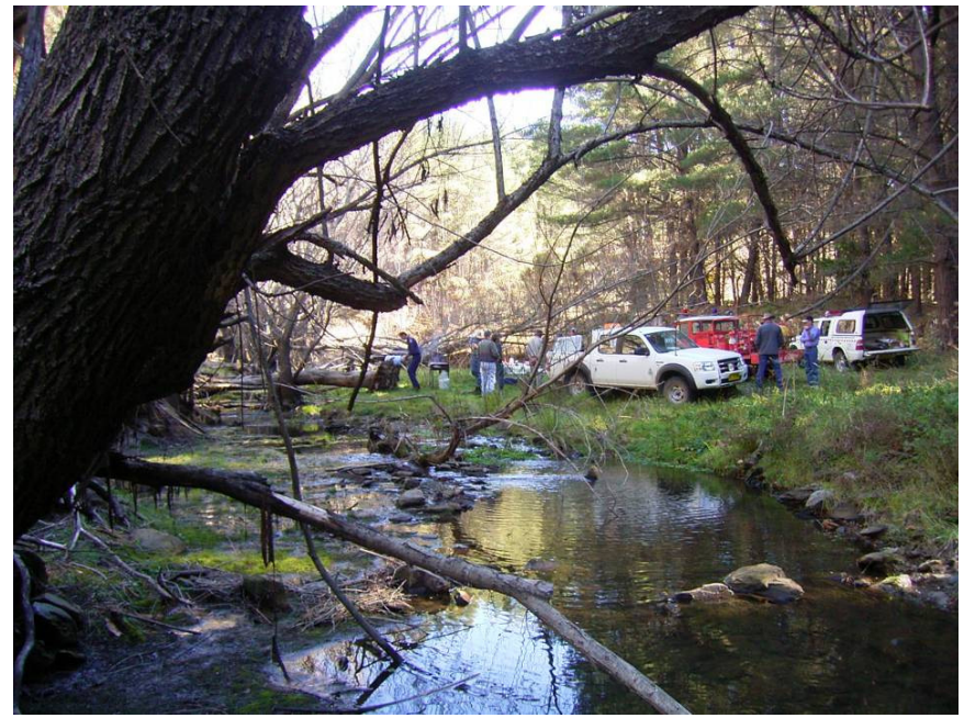
Gum Tree Meeting at Newbridge and Kings Plains

The progress made from this strategy of actively communicating with our volunteers on a regular basis is working to build a strong rapport between our staff and volunteers. The continual message at each meeting from the volunteers is to keep these meeting going as they productive, enjoyable and a great thing.