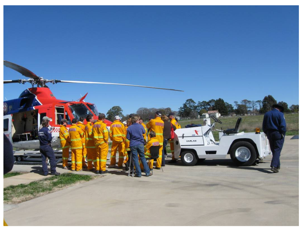
Canobolas Cadets in action 2009.