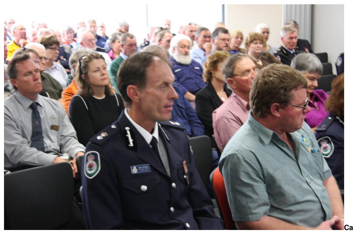
Canobolas Fire Control Centre Opening

To provide a cohesive, enthusiastic Volunteer Rural Fire Service trained and equipped to meet the needs of the community in an efficient, effective and professional manner.