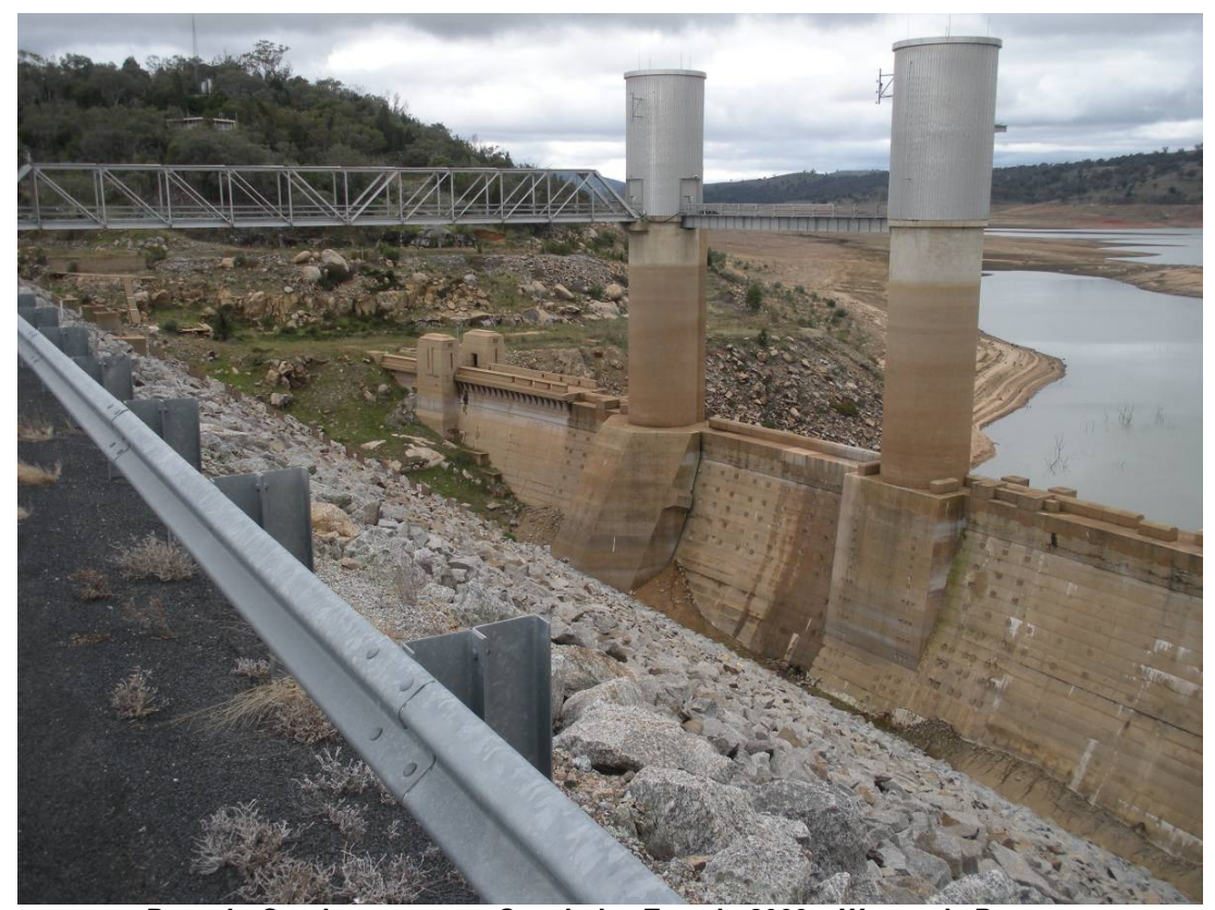
Drought Continues across Canobolas Zone in 2009 - Wyangala Dam