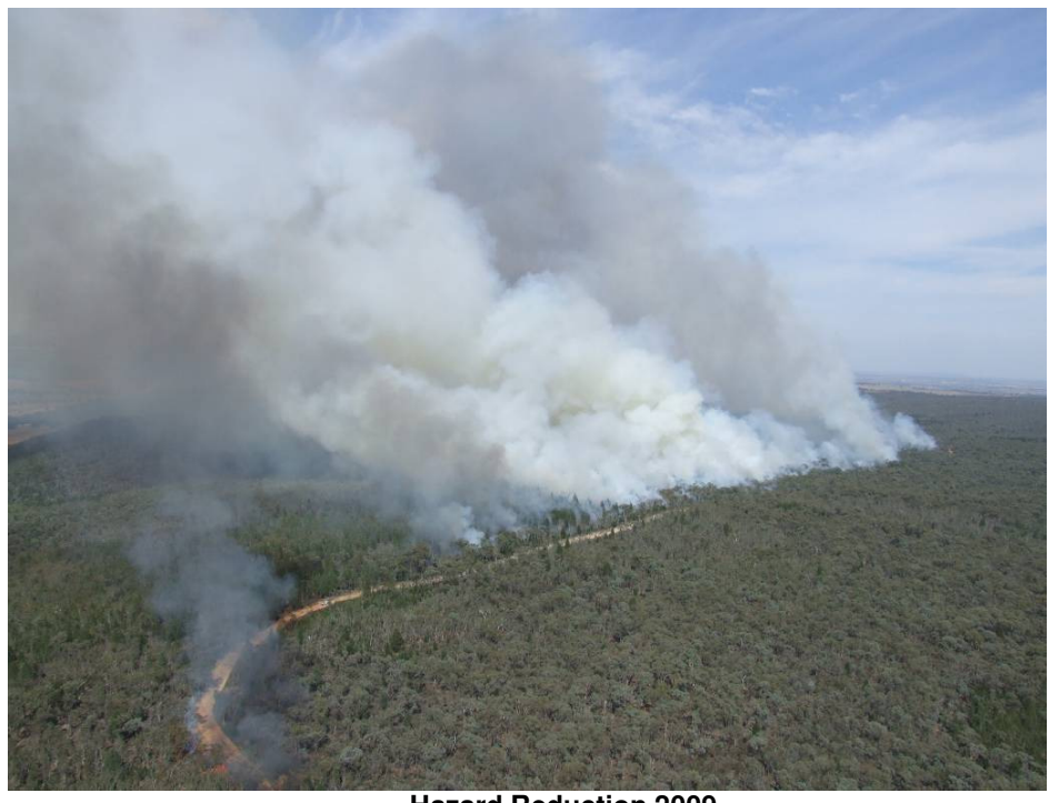
Hazard Reduction 2009