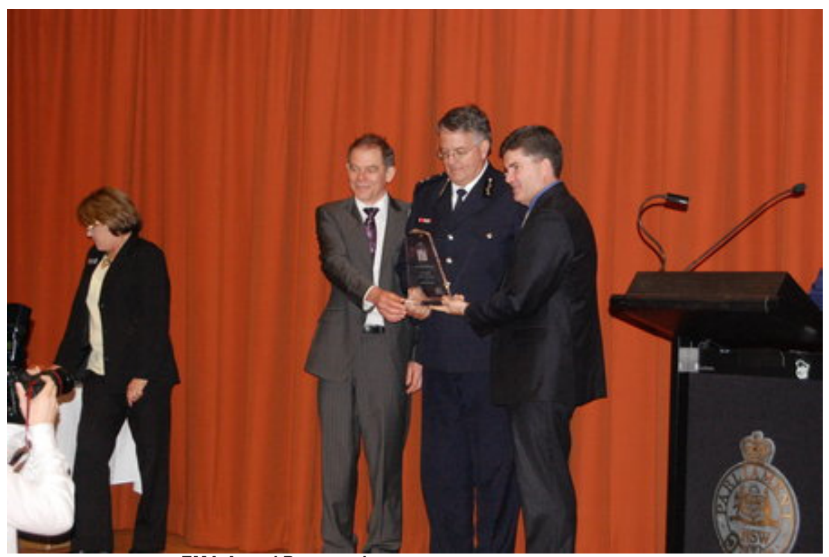
EMA Award Presentation