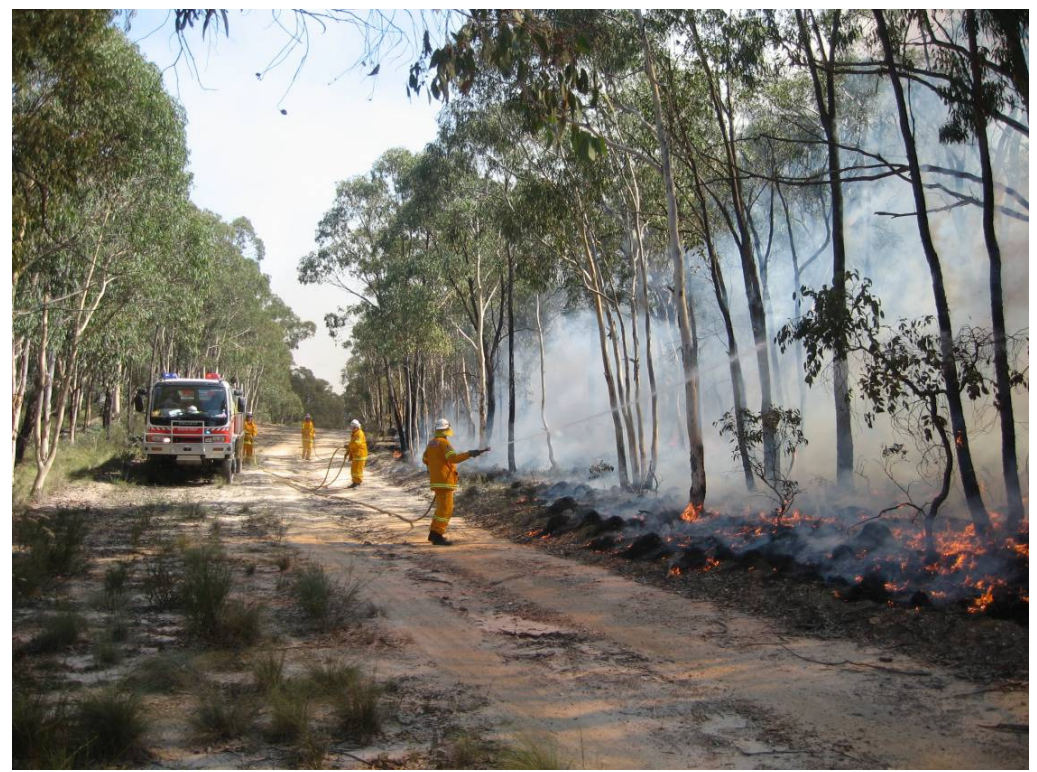
Hazard Reduction 2009