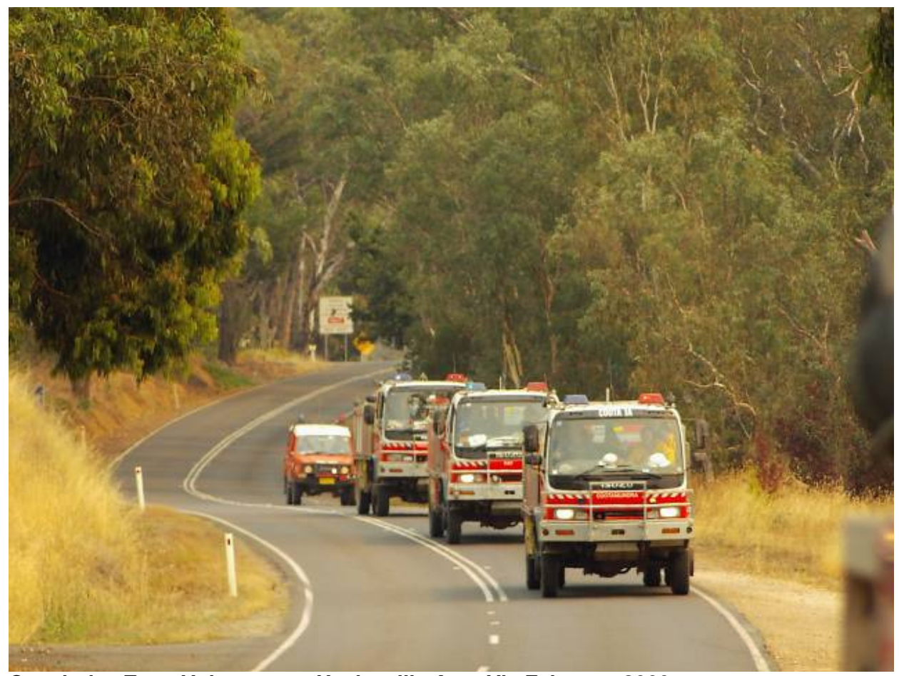
Canobolas Zone Volunteers – Healesville Area Vic February 2009